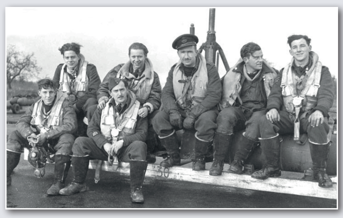
The crew of Halifax NP793

On the night of 5 March 1945, 35 Canadian casualties buried in this cemetery lost their lives. That night, 270 planes were setting off on a mission to bomb Chemnitz, Germany. The planes took off from different air bases with