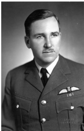
Ronald Weir is buried in Plot XVI, Row A, Grave 15.