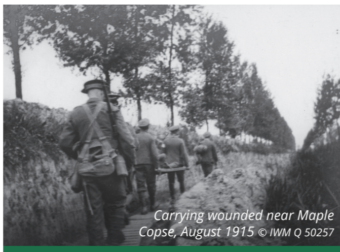
Carrying wounded near Maple Copse, August 1915