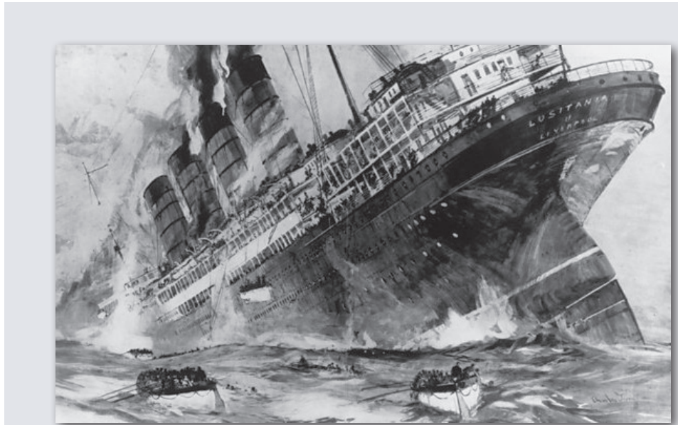
The sinking of the Lusitania